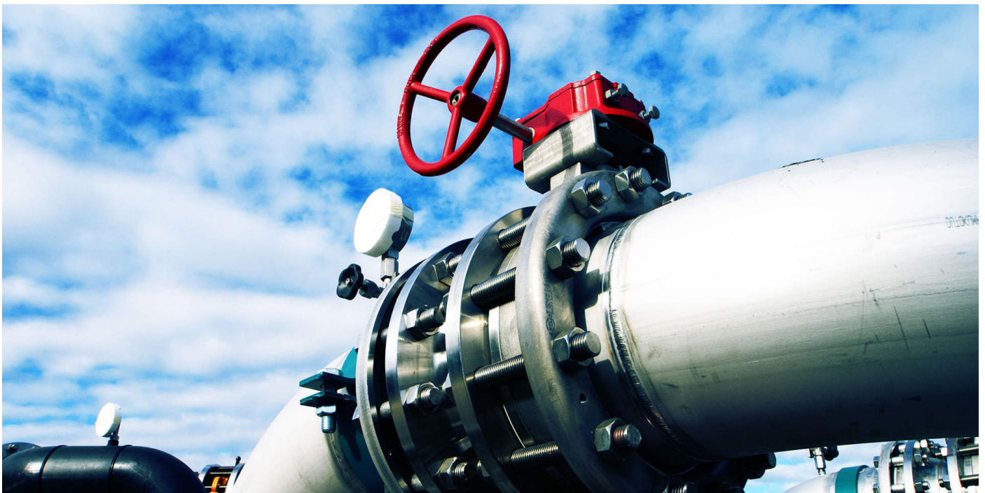
Azerbaijan drops out of negotiations on buying a share of Greek national gas transmission system operator DESFA.

In May, Azerbaijan ends four-year-long negotiations on buying a share of the Greek national gas transmission system operator DESFA with no result. The country's partnership with Russia faces a new crisis, while the window might open up in relations with the USA.