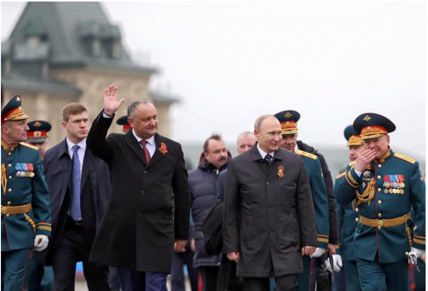
The President of Moldova Igor Dodon is the only foreign head of the state who participated in the military parade in Moscow.

Reviewing the electoral system, forced by the Democratic Party, not only polarizes the society of the Republic of Moldova but also, judging by all symptoms, creates a risk for leaving the country without any financial aid promised by the European Union. The civil society warns about possible pressure from the authorities and anti-democratic tendencies, while foreign partners call on Chisinau to provide pluralism and mass media independence